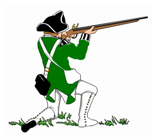
IN THIS ISSUE